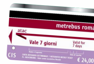
Weekly pass (CIS) € 24.00