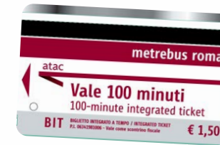
One-way ticket (BIT) € 1.50