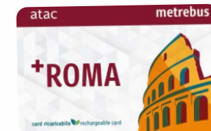
MULTIBIT €3.00 – €15.00