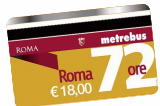
Metrebus 72 hours € 18.00