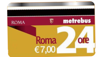
Metrebus 24 hours € 7.00