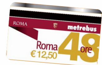
Metrebus 48 hours € 12.50